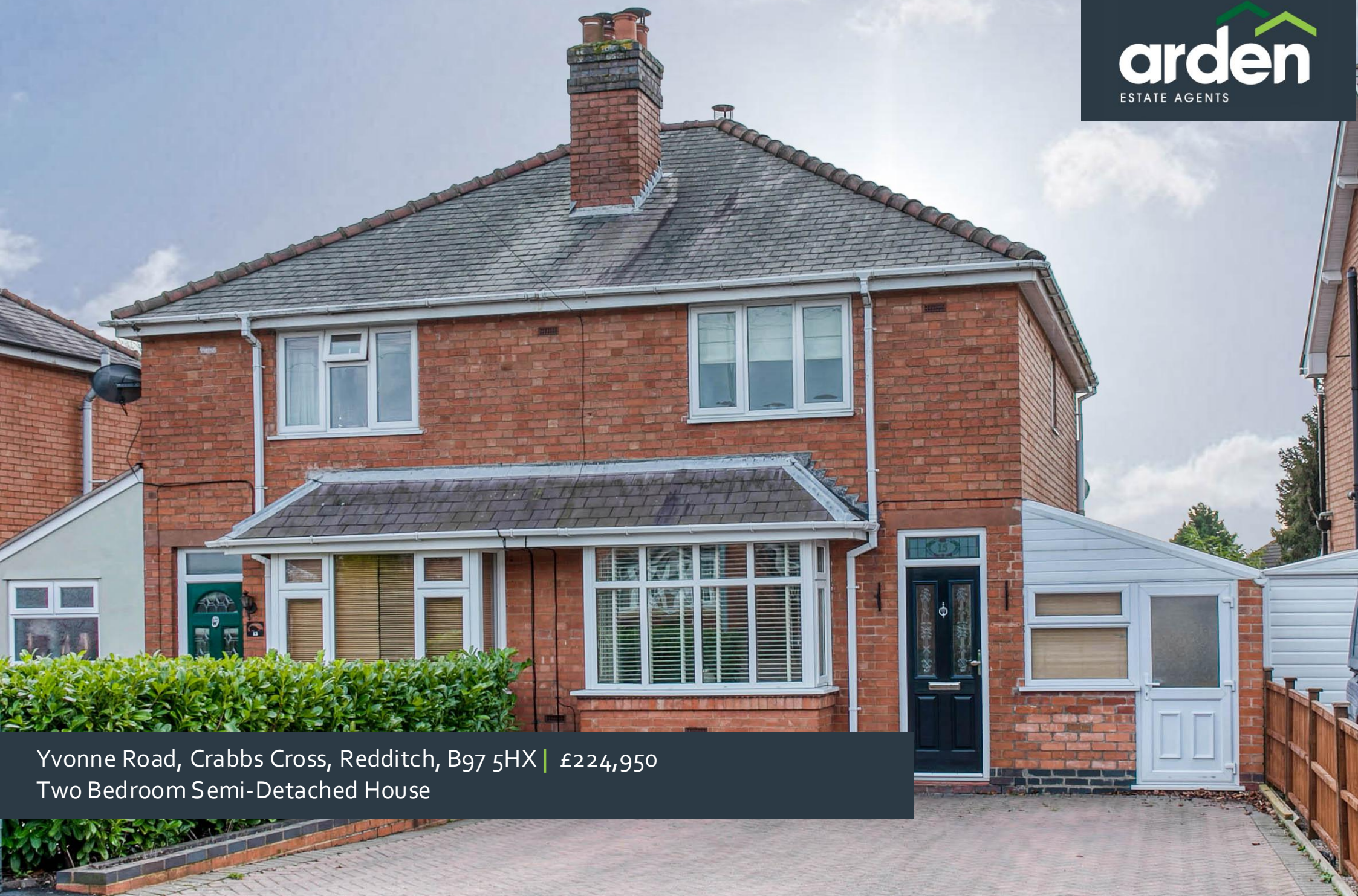
Yvonne Road, Crabbs Cross, Redditch, B97 5HX | £224,950 Two Bedroom Semi-Detached House