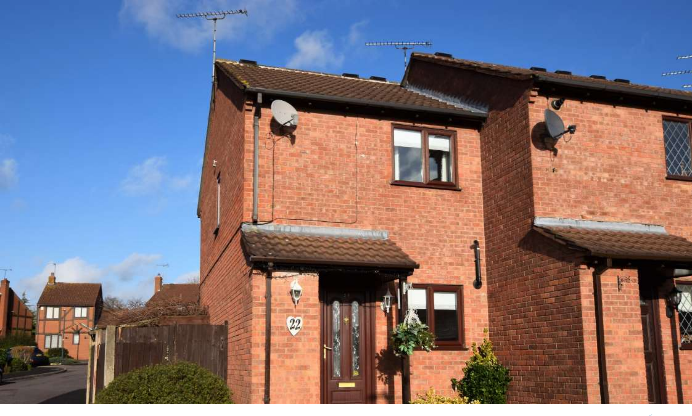
22 Brixham Close, Nuneaton, CV11 6YT £180,000 Freehold