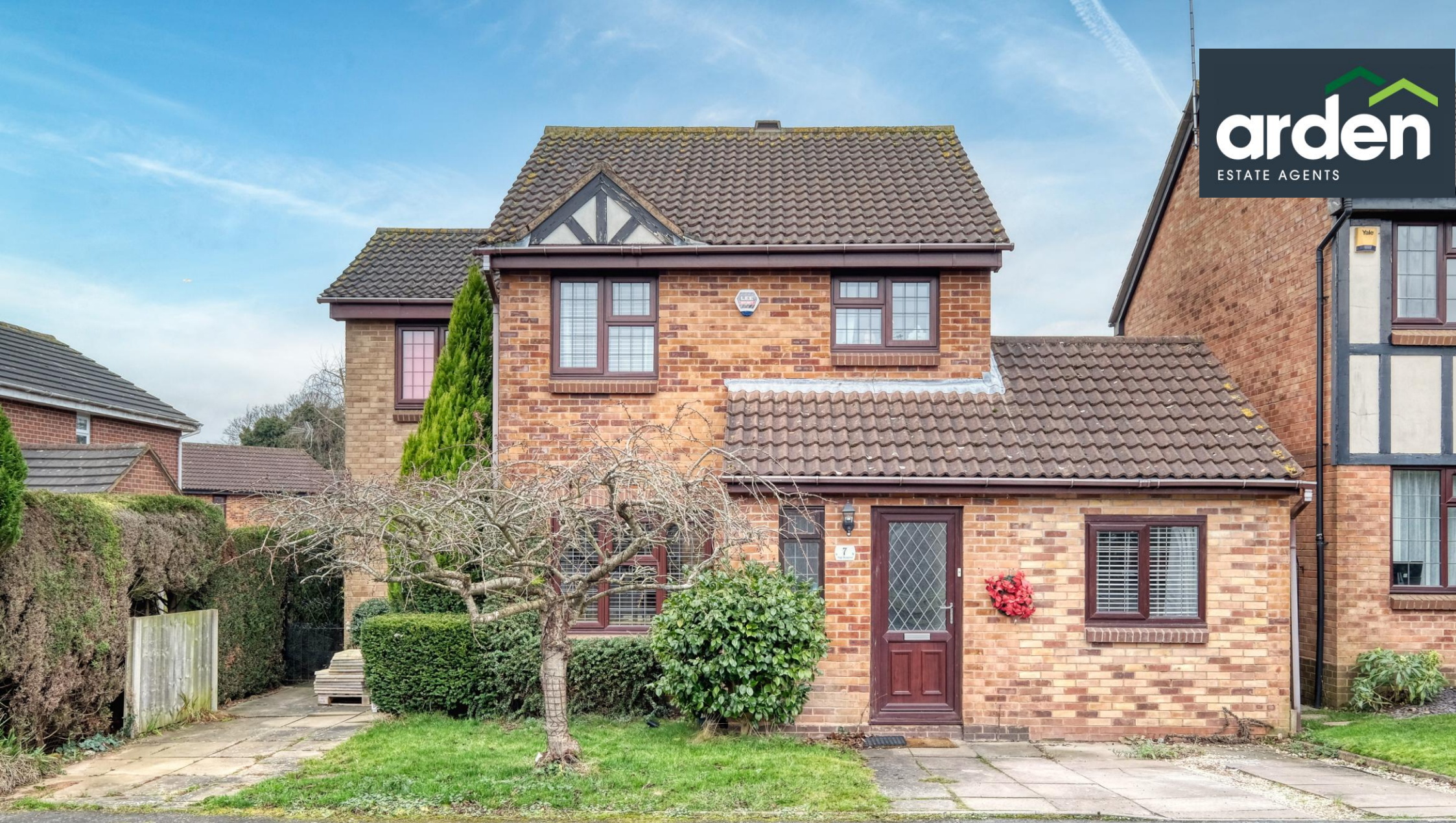
High Meadows, Stoke Heath, Bromsgrove, B60 3QR | Offers Over £350,000 Four Bedroom Detached House