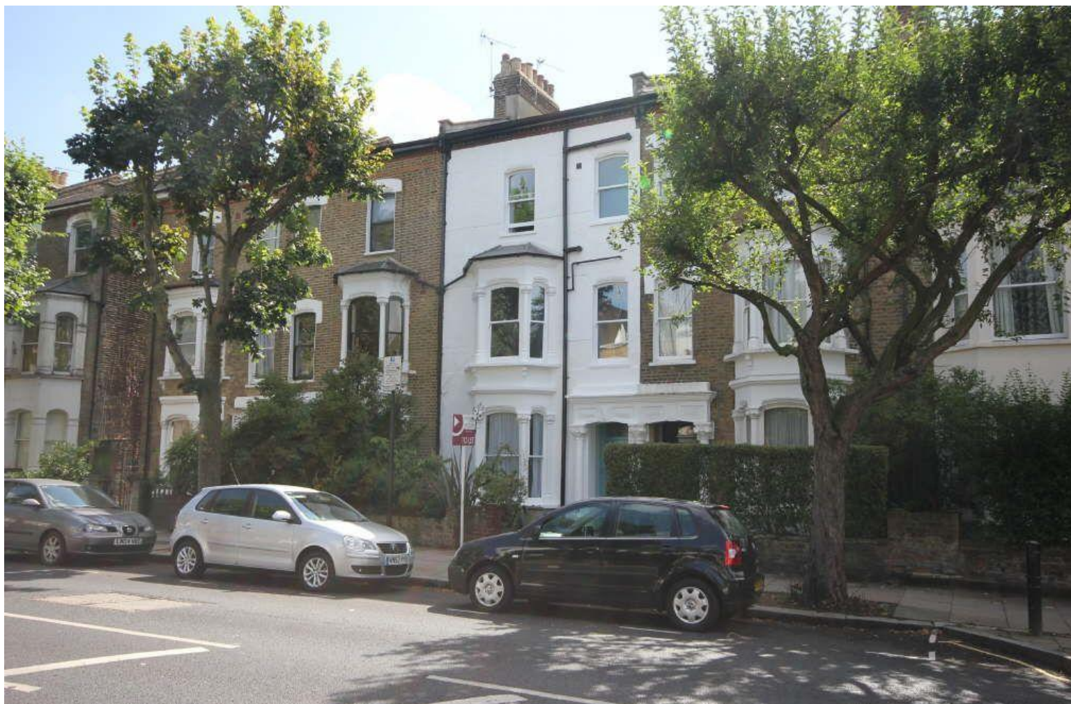
Hanley Road N4 3DR