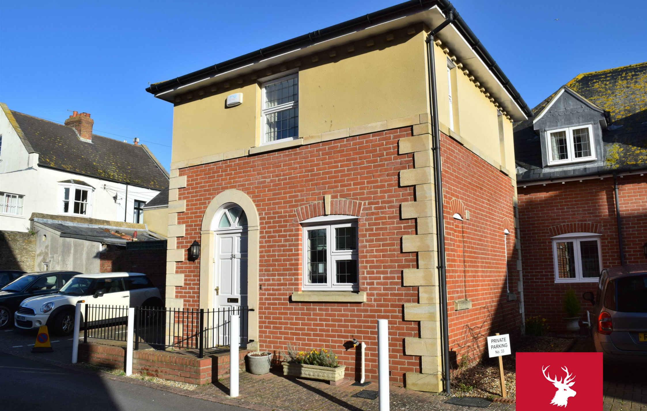
34 Folly Mill Lodge