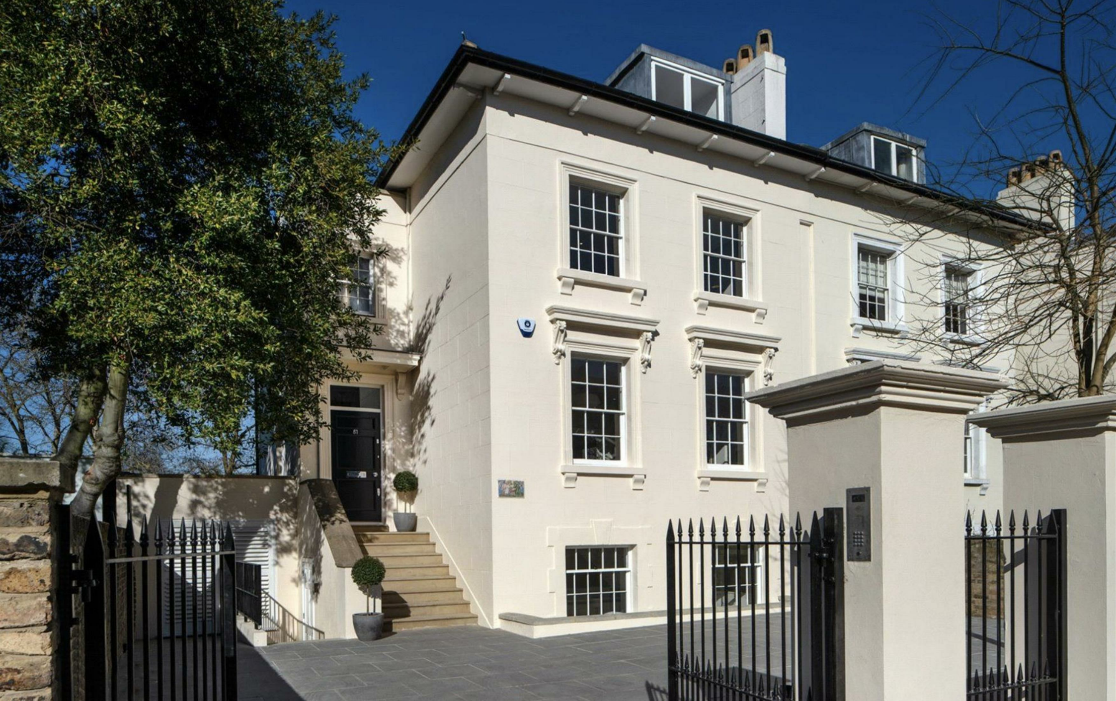
51 Queens Grove, St John's Wood London NW8 6EN Asking price £7,500,000 Freehold