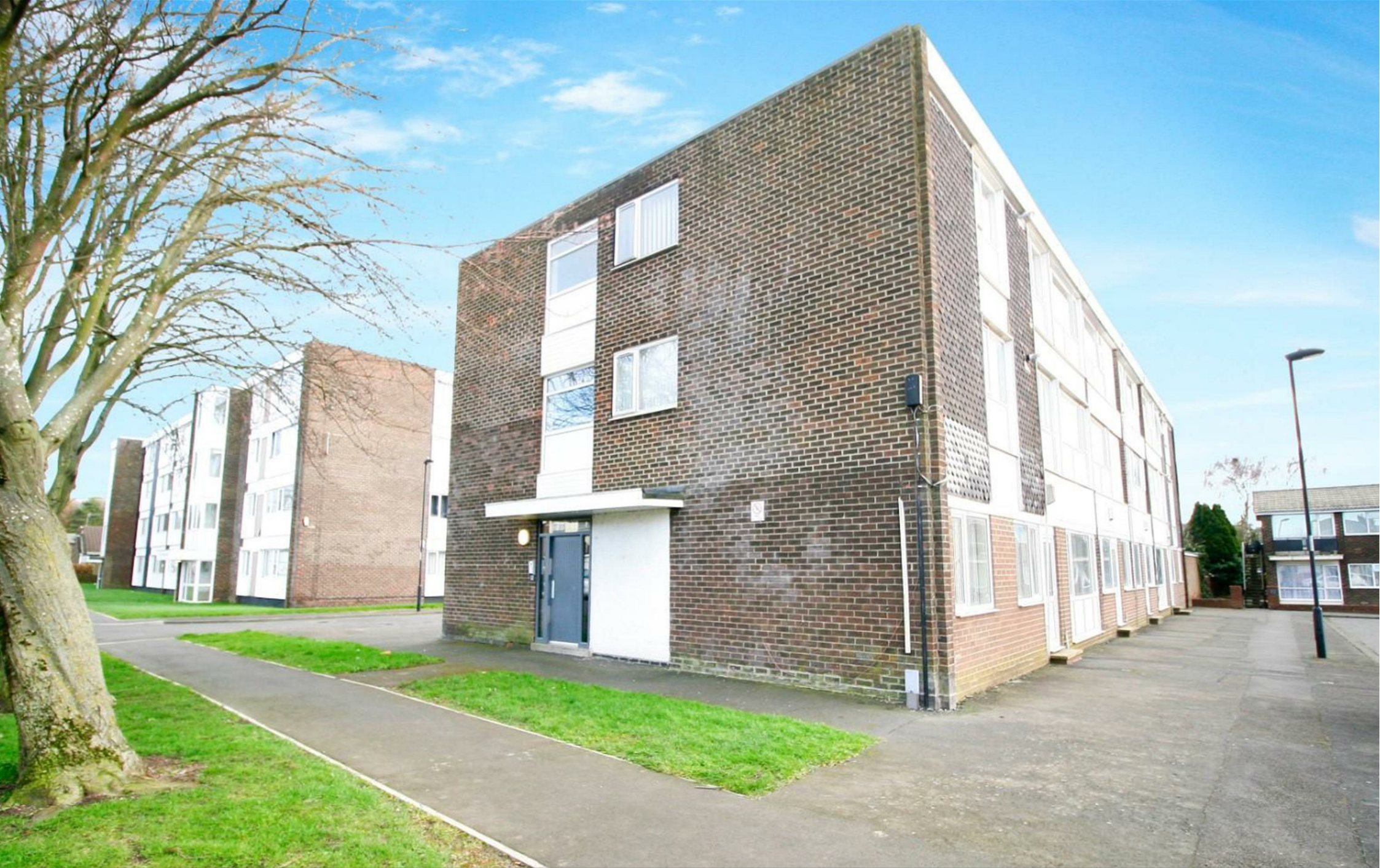
📍 Boston Court, Newcastle Upon Tyne NE12 9RA