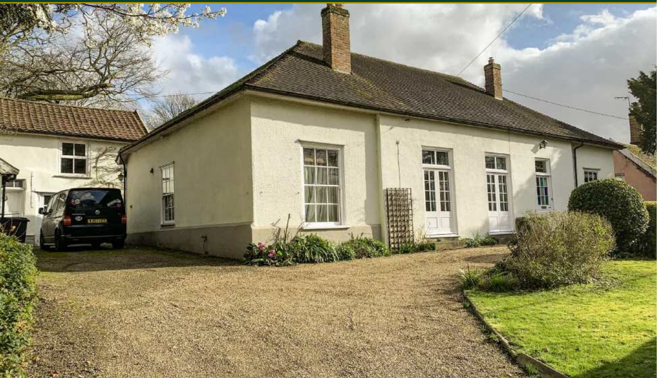
Hill House, 2 Victoria Hill, Eye