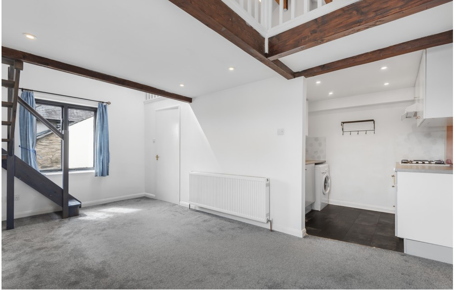
Living Room Open to Kitchen