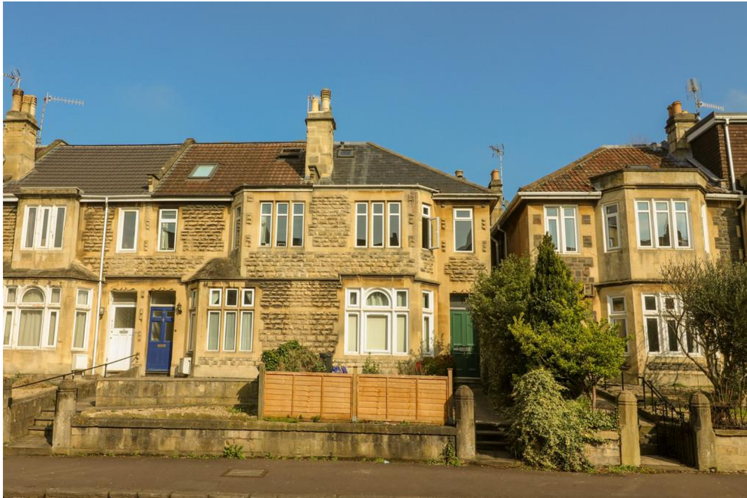
Upper Maisonette, 15 Crescent Gardens, Bath, BA1 2NA