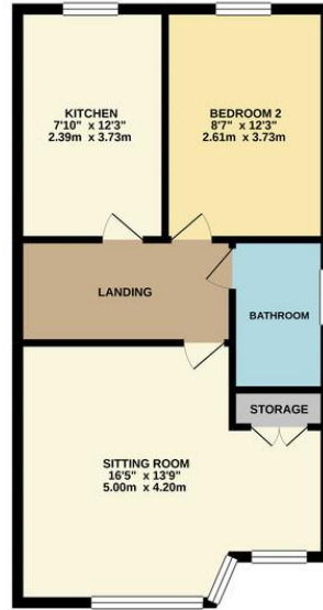
1ST FLOOR 503 sq.ft. (46.8 sq.m.) approx.