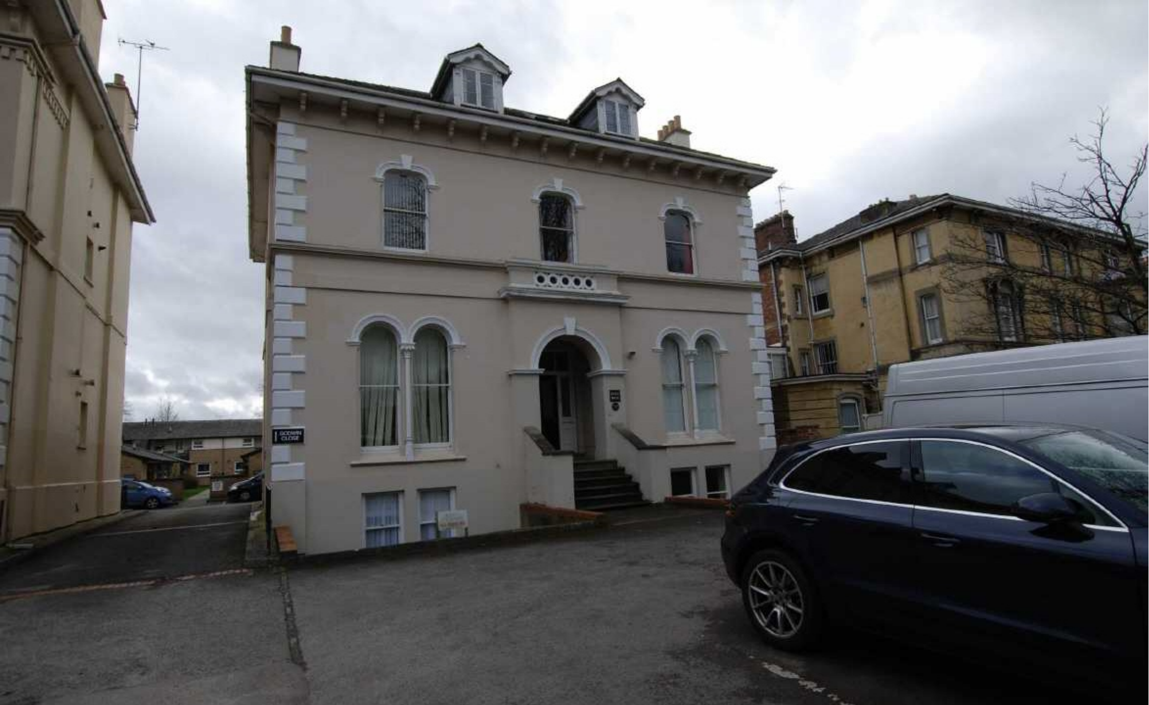
18 Irving House, Pittville Circus Road, Cheltenham, GL52 2PZ £104,000 Leasehold