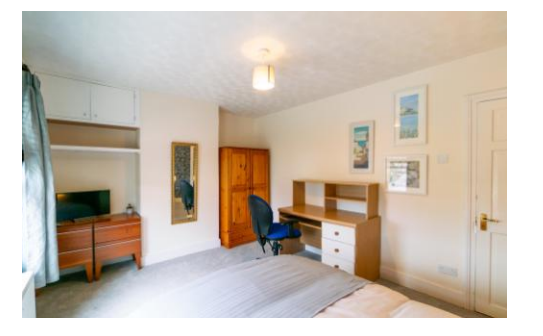
12 Star Road Caversham, Reading, Berkshire, RG4 5BS