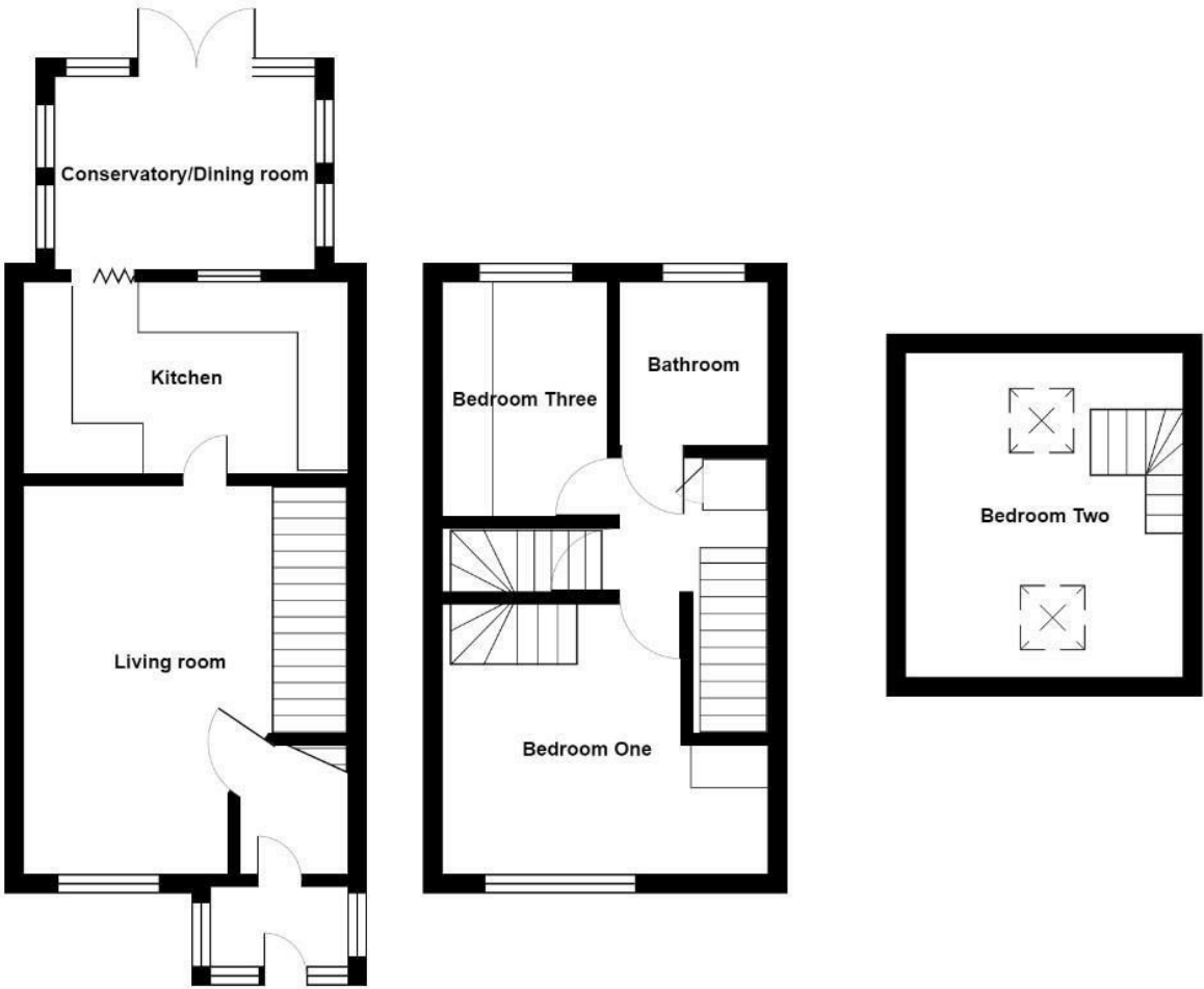
16 clos y dyfrgi, Thornhill

3 Bedrooms - Cardiff - CF14 9HW - £215,000 Freehold