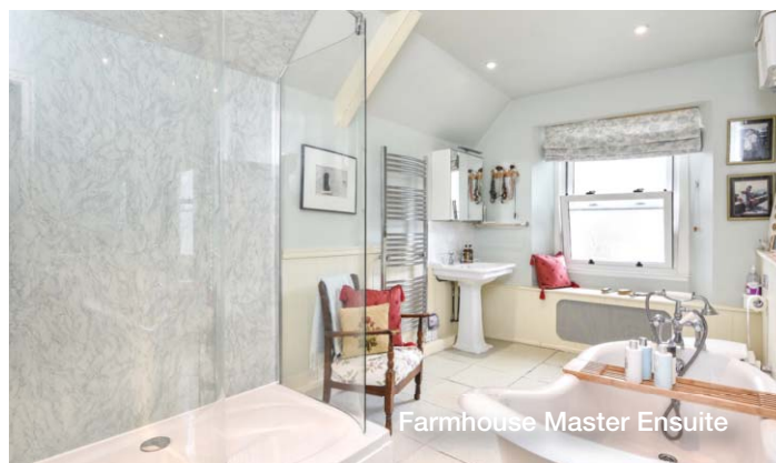
Farmhouse Master Ensuite