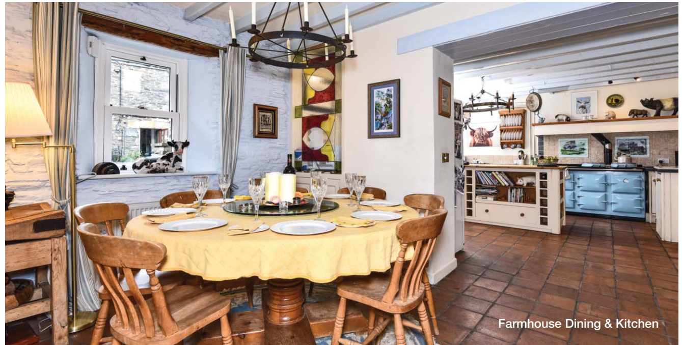
Farmhouse Dining & Kitchen

The village of St Neot (1 ½ miles) has a number of amenities, including a pub, general store, post office, primary school and church. The market town of Liskeard (4 miles) has a wide range of shopping facilities and a mainline railway station with connections to London. Looe (12 miles) is divided by the river creating East and West Looe and has a fine sandy beach and attractive fishing harbour. The town offers a selection of activities including excellent bathing, good yachting and river and sea trips as well as a wide range of shops for day to day needs. Plymouth (23 miles) has extensive shopping facilities, the historic Barbican district and the National Marine Aquarium. Plymouth offers access to cross channel ferry services and there are airports at Newquay and Exeter.