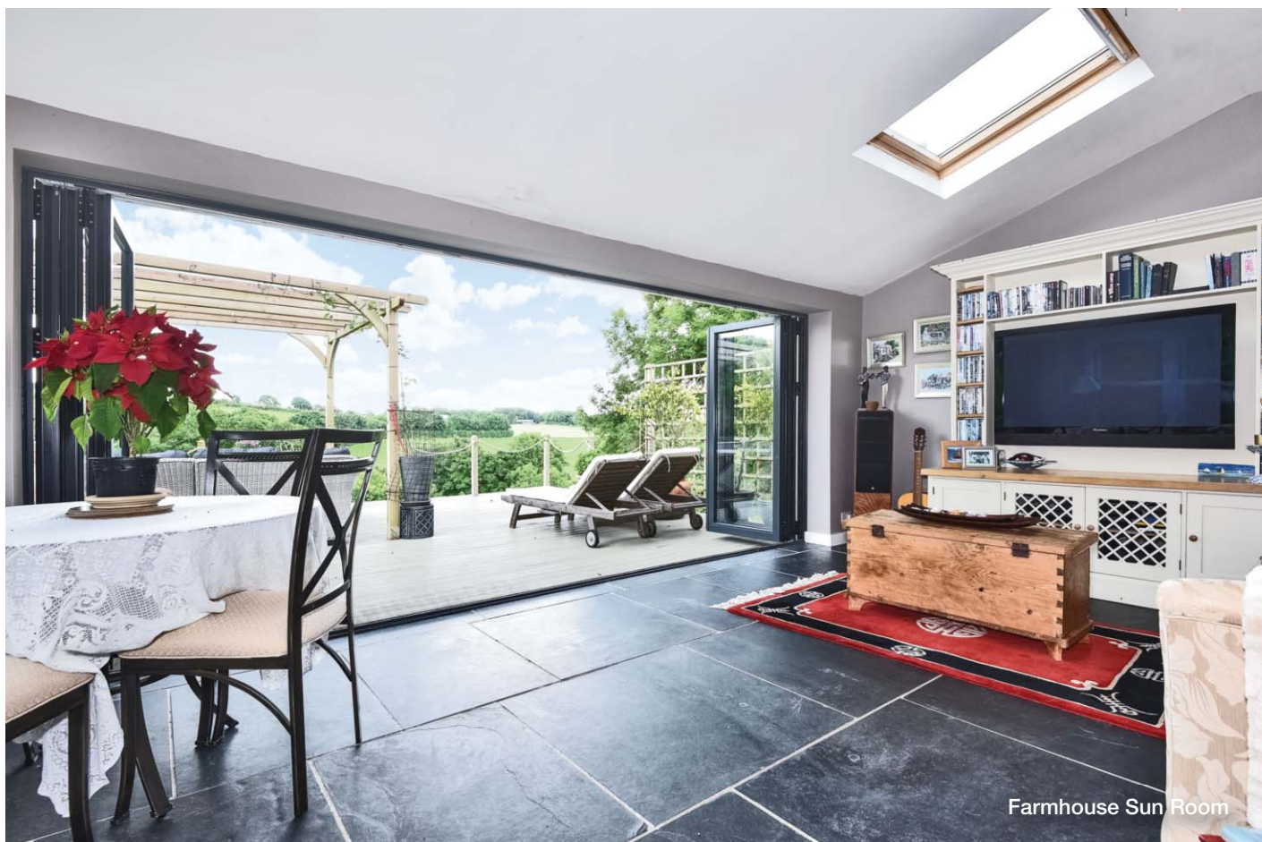
Farmhouse Sun Room