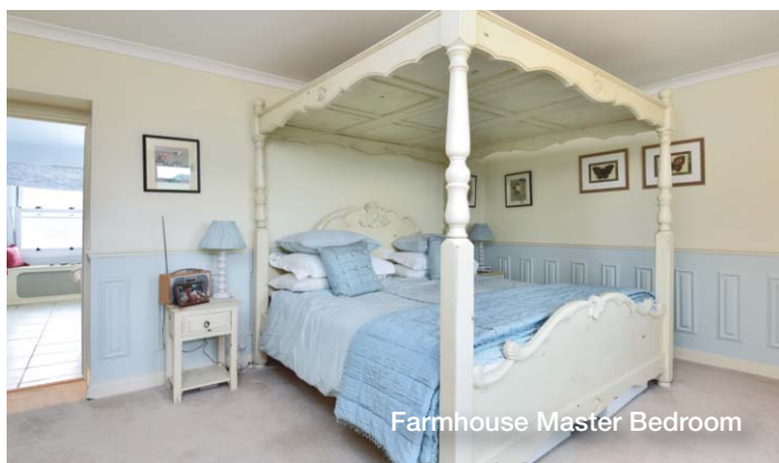
Farmhouse Master Bedroom