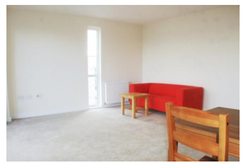
The Edition, Colindale, London NW9 £2,400 pcm

Mile is delighted to bring to the rental market this fantastic three double bedroom apartment set on the fourth floor of this Brand New Development opposite Colindale (Northern line) station and benefits include three double bedrooms, two modern bathrooms (one ensuite), large 16ft approx. reception room with double aspect windows and direct access onto a great size private balcony with great views, a modern fitted kitchen with Granite worktops, plenty of storage, secure underground gated parking space, communal gardens, lift and video entryphone.