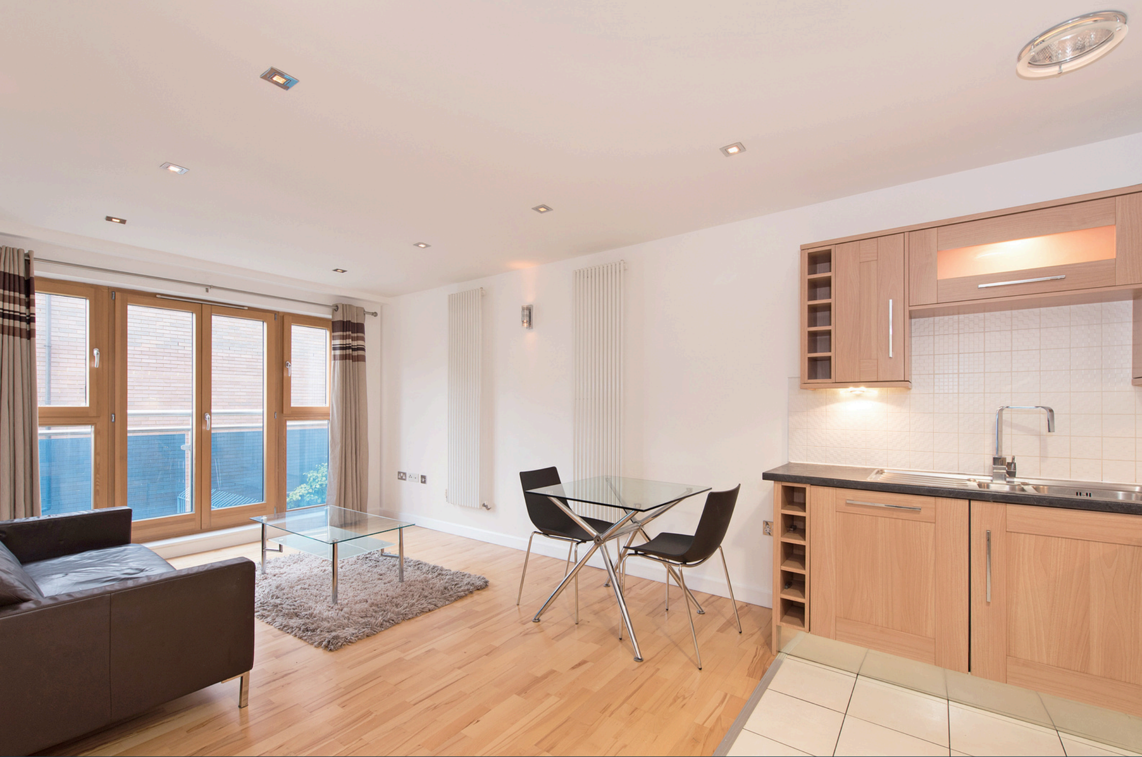
VIBECA APARTMENTS, 7 CHICKSAND STREET, LONDON, E1 5LD