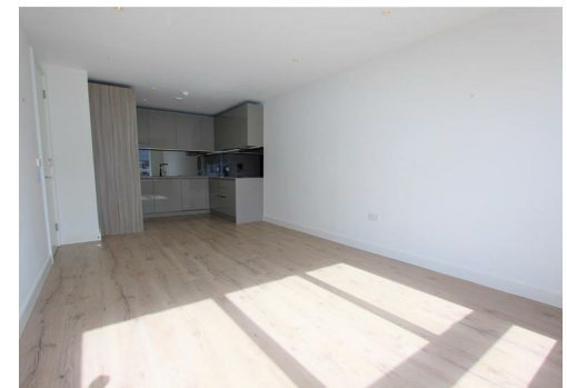
High Street, Hornsey N8