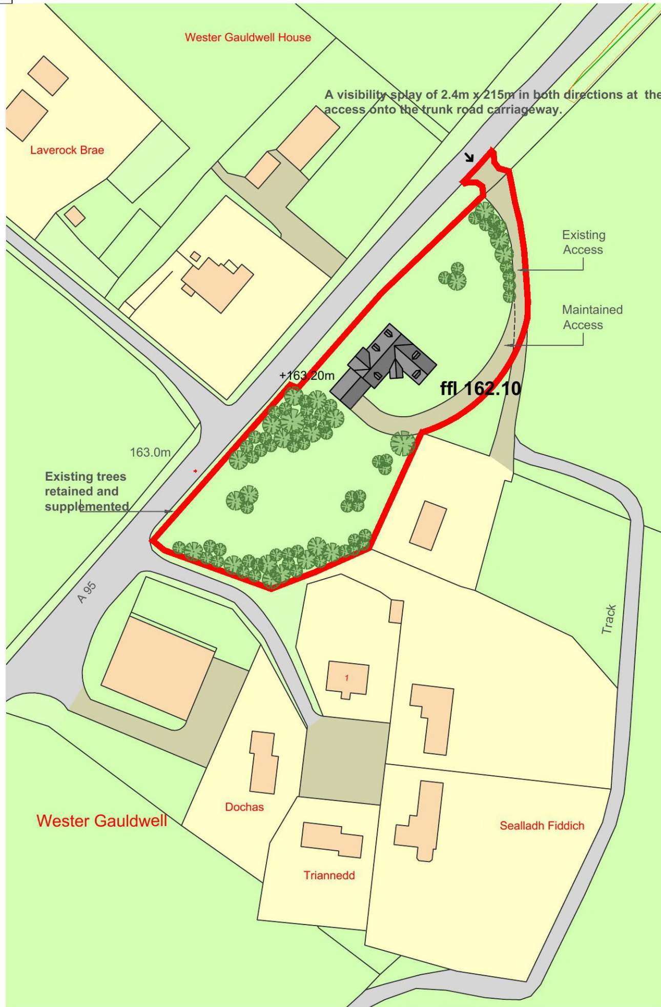
Site Plan Scale 1:1000