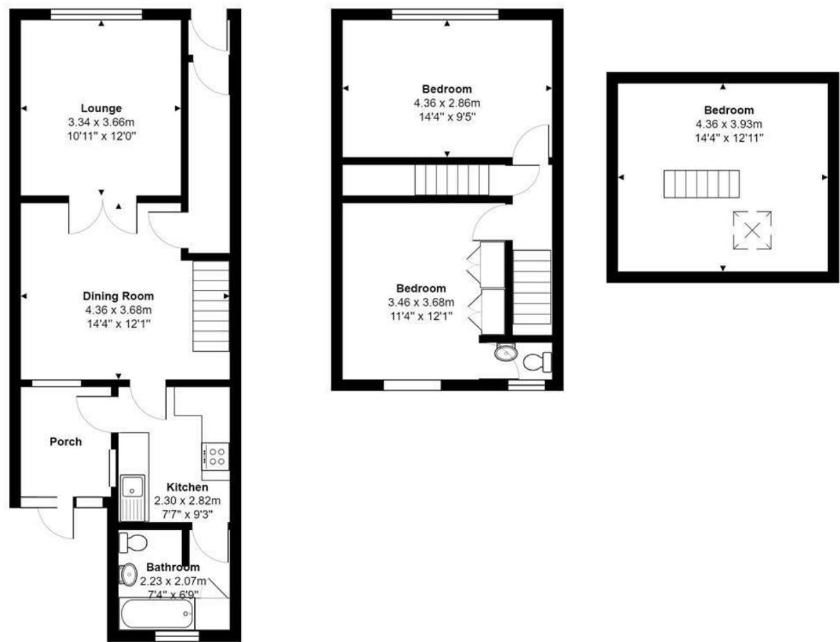
Total Area: 95.5 m² ... 1028 ft² All measurements are approximate and for display purposes only