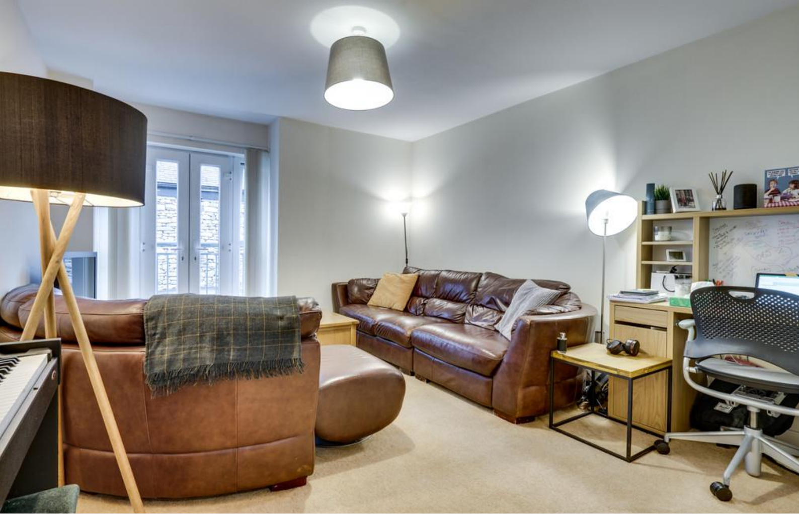
Lounge with Juliet Balcony