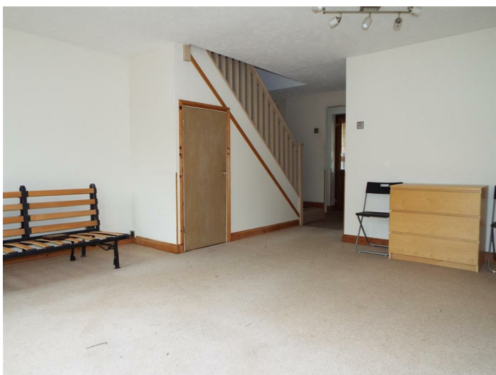
Reception Alternate View