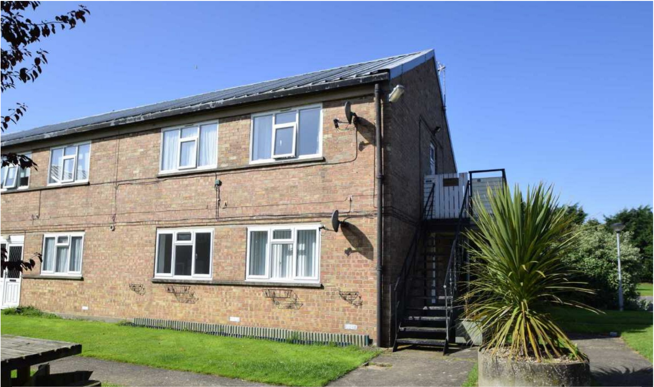
5 Freshfields Bridlington YO15 3QQ