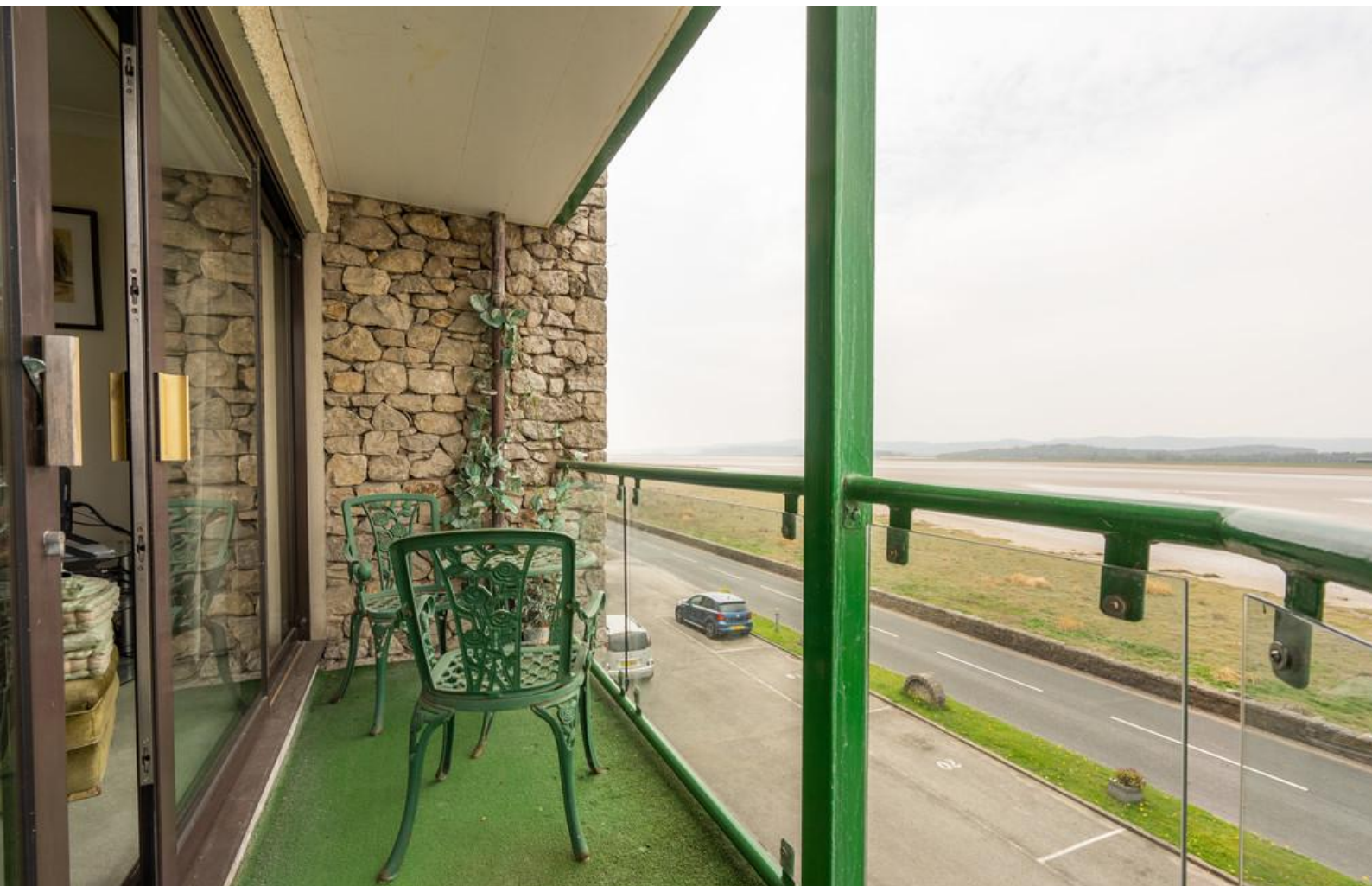
Balcony and Views