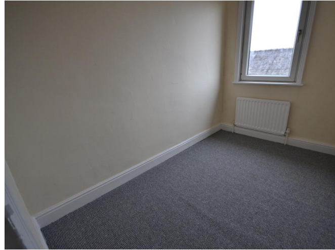
to rear elevation.

KITCHEN Fitted kitchen comprising of a range of base units with worktops over, stainless steel sink and drainer with mixer tap, UPVC double glazed window to rear elevation, part glazed UPVC door leading to rear yard area, wall mounted radiator, wall mounted "Biasi" boiler.