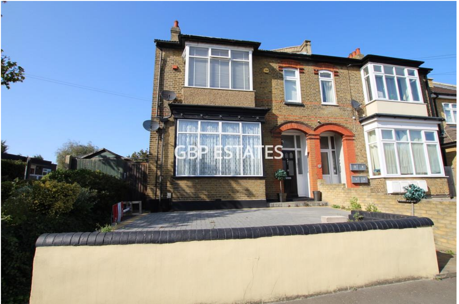
Clydesdale Road, Hornchurch RM11 G/P £280,000 - £290,000 Leasehold