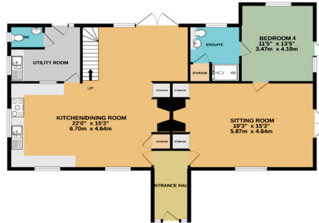
GROUND FLOOR 1218 sq.ft. (113.2 sq.m.) approx.