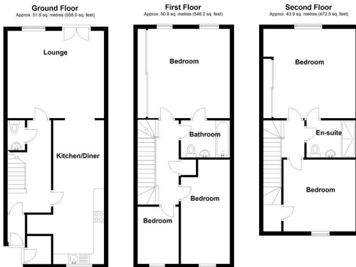
Total area: approx. 146.7 sq. metres (1578.8 sq. feet)

With large lawned area and elevator providing access to underground allocated parking