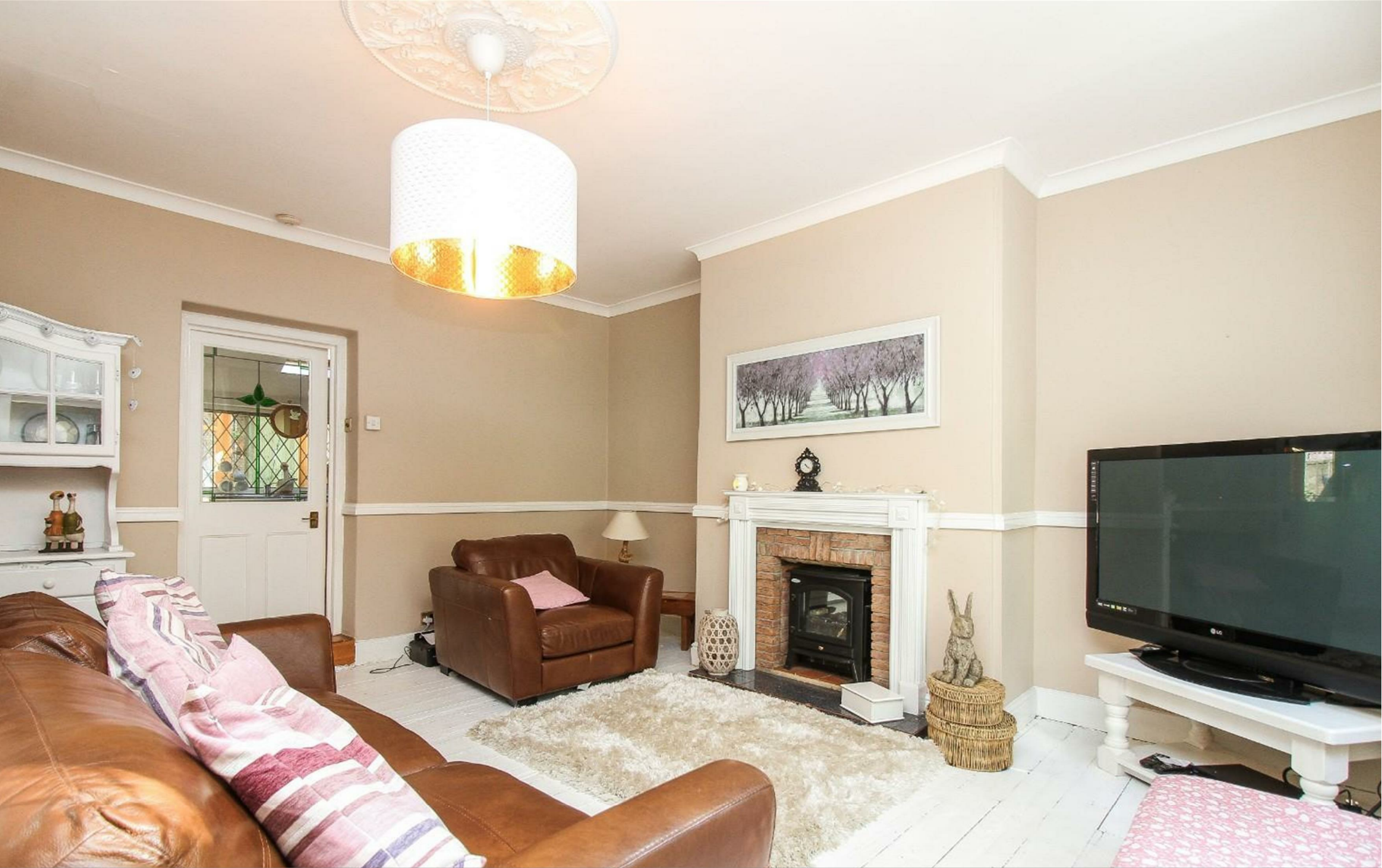
📍 Sledgedale Cottages, Killingworth NE12 6BL