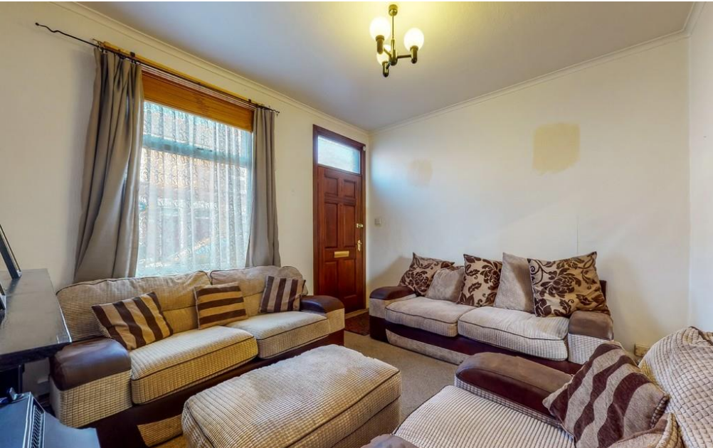
Front Reception Room