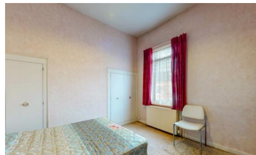
Front Bedroom 1