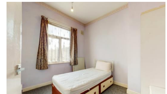
Rear Bedroom 2