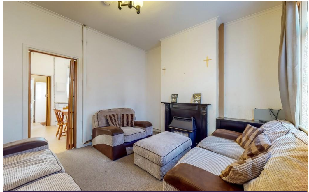
Front Reception Room