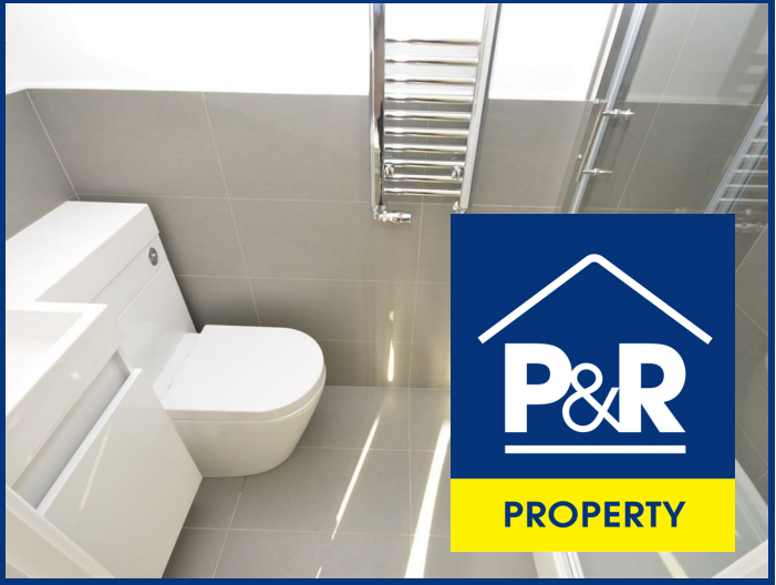
Room 3, Flat 2 48 Reginald Street, Luton, Bedfordshire, LU2 7QZ £500