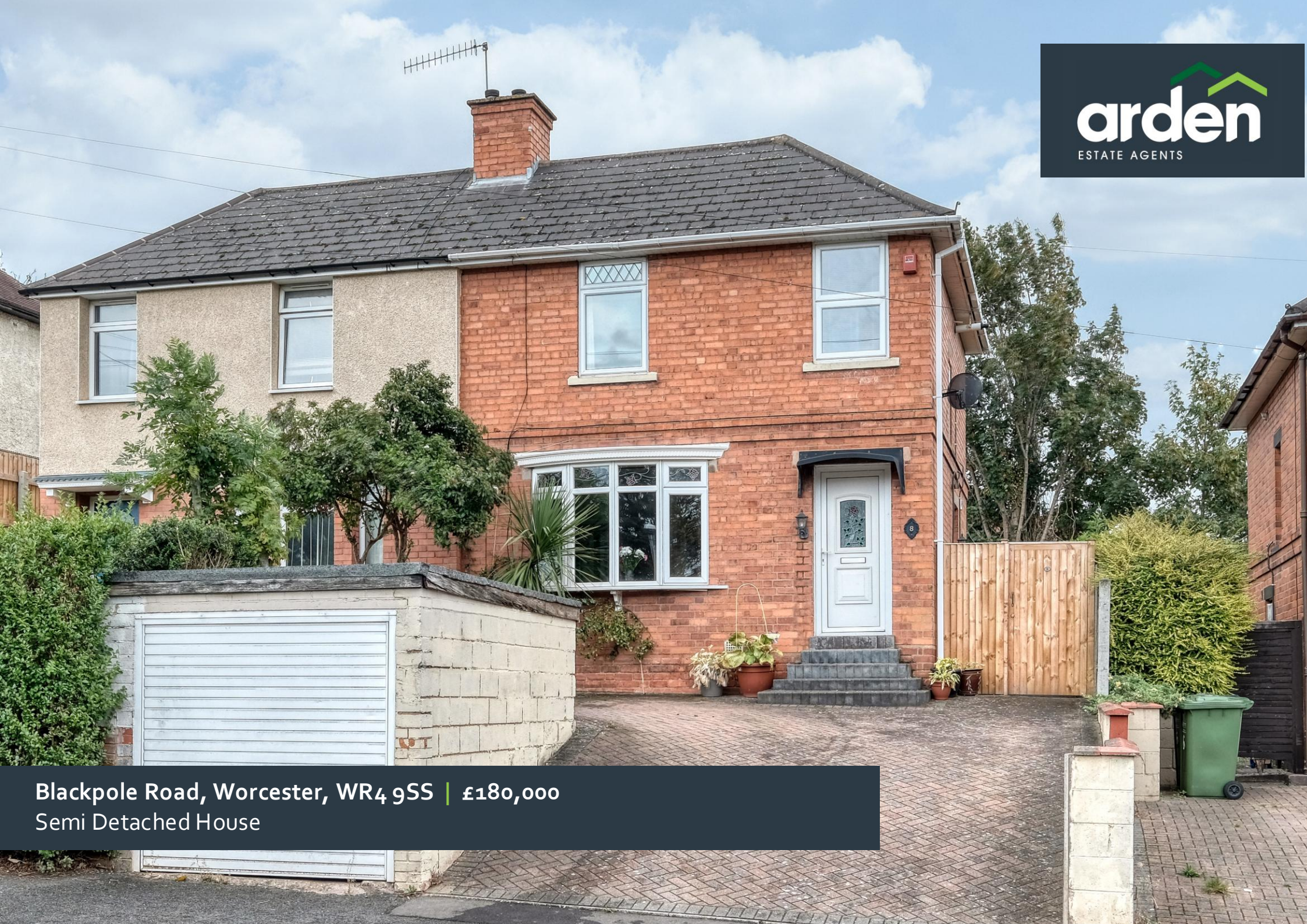
Blackpole Road, Worcester, WR4 9SS | £180,000 Semi Detached House