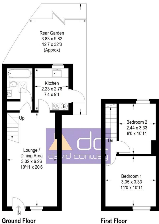
Illustration for identification purposes only, measurements are approximate, not to scale. David Conway © 2020 (ID 689673)

Approximate Gross Internal Area 56.2 sq m / 605 sq ft