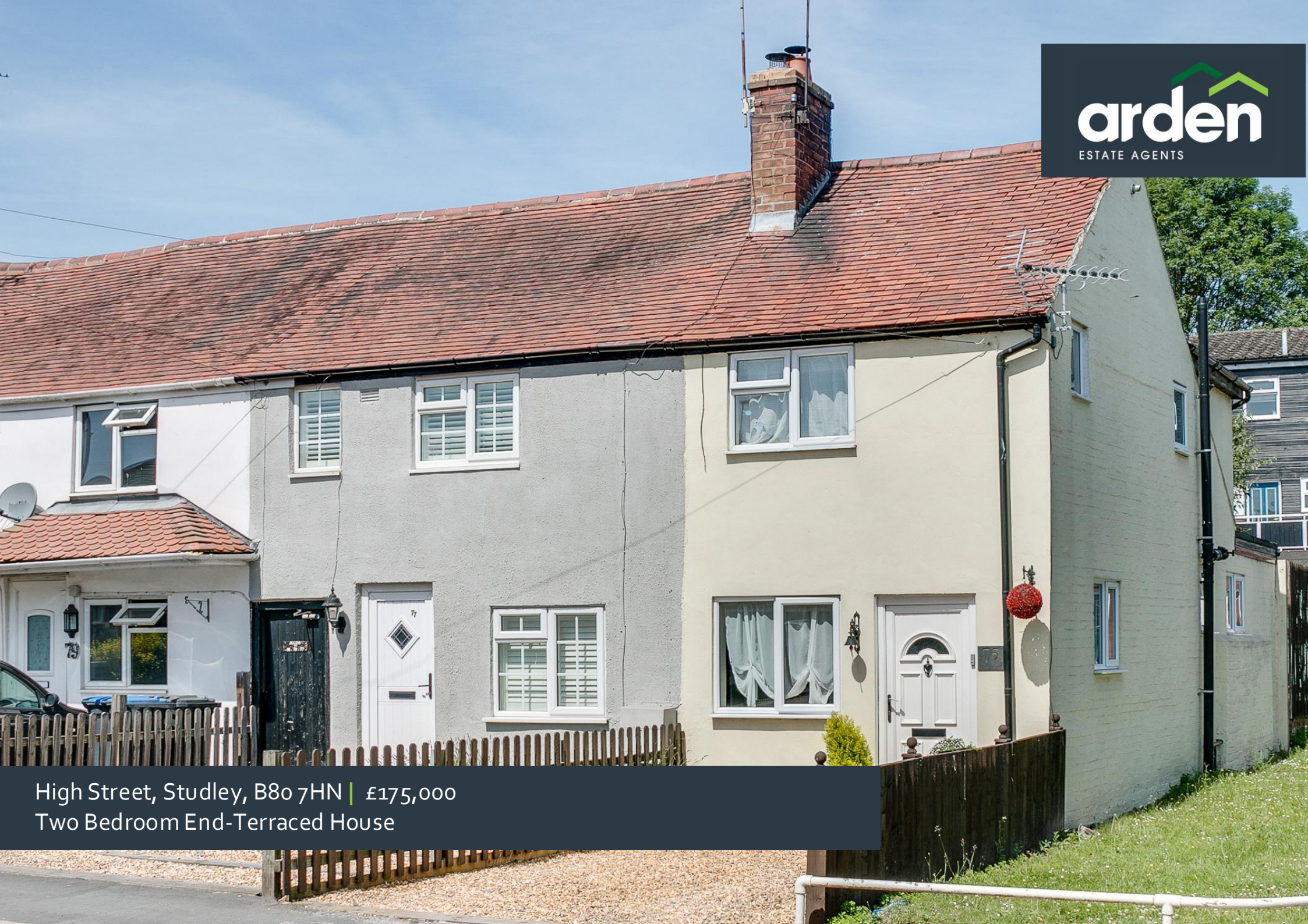
High Street, Studley, B80 7HN | £175,000 Two Bedroom End-Terraced House