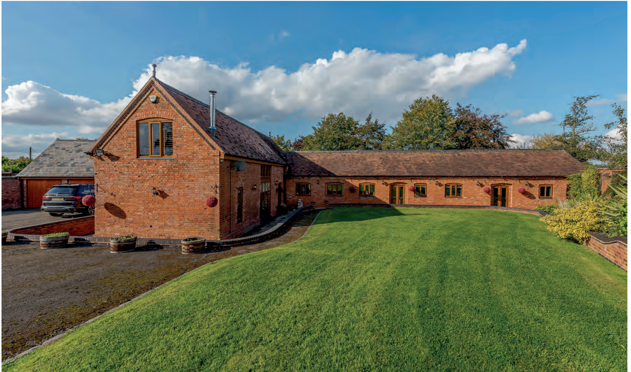
Bow Barn Bow Lane | Withybrook | CV7 9LQ