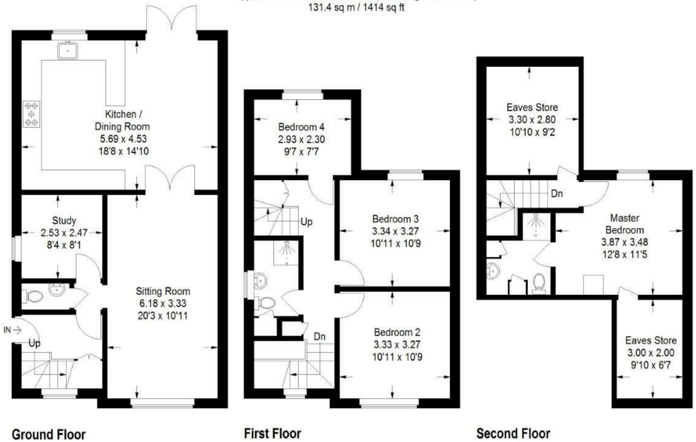
Illustration for identification purposes only, measurements are approximate, not to scale. (ID694622)

Approximate Gross Internal Area (Excluding Eaves Store) 131.4 sq m / 1414 sq ft