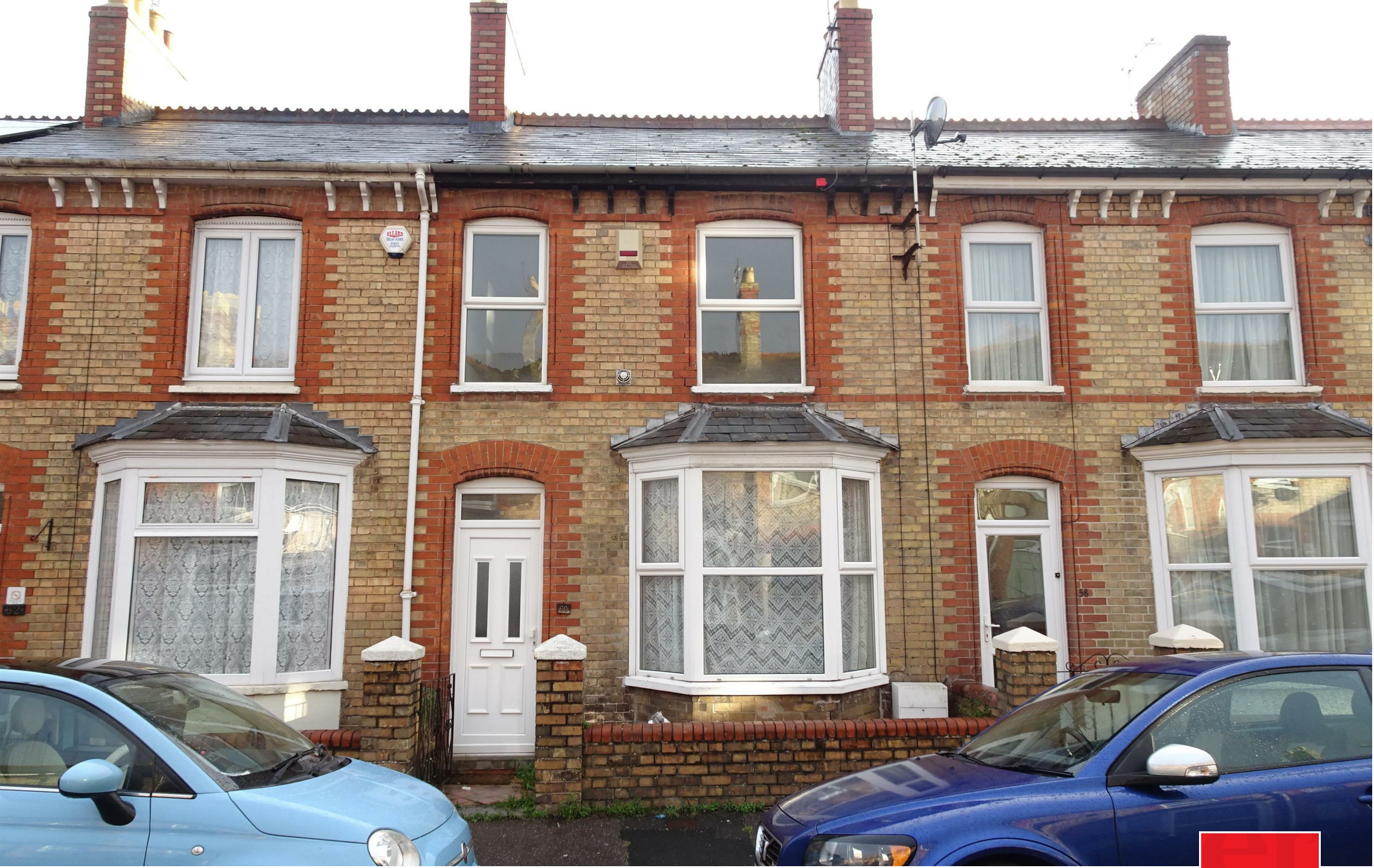
60 Winchester Street, Taunton, Somerset, TA1 1QF