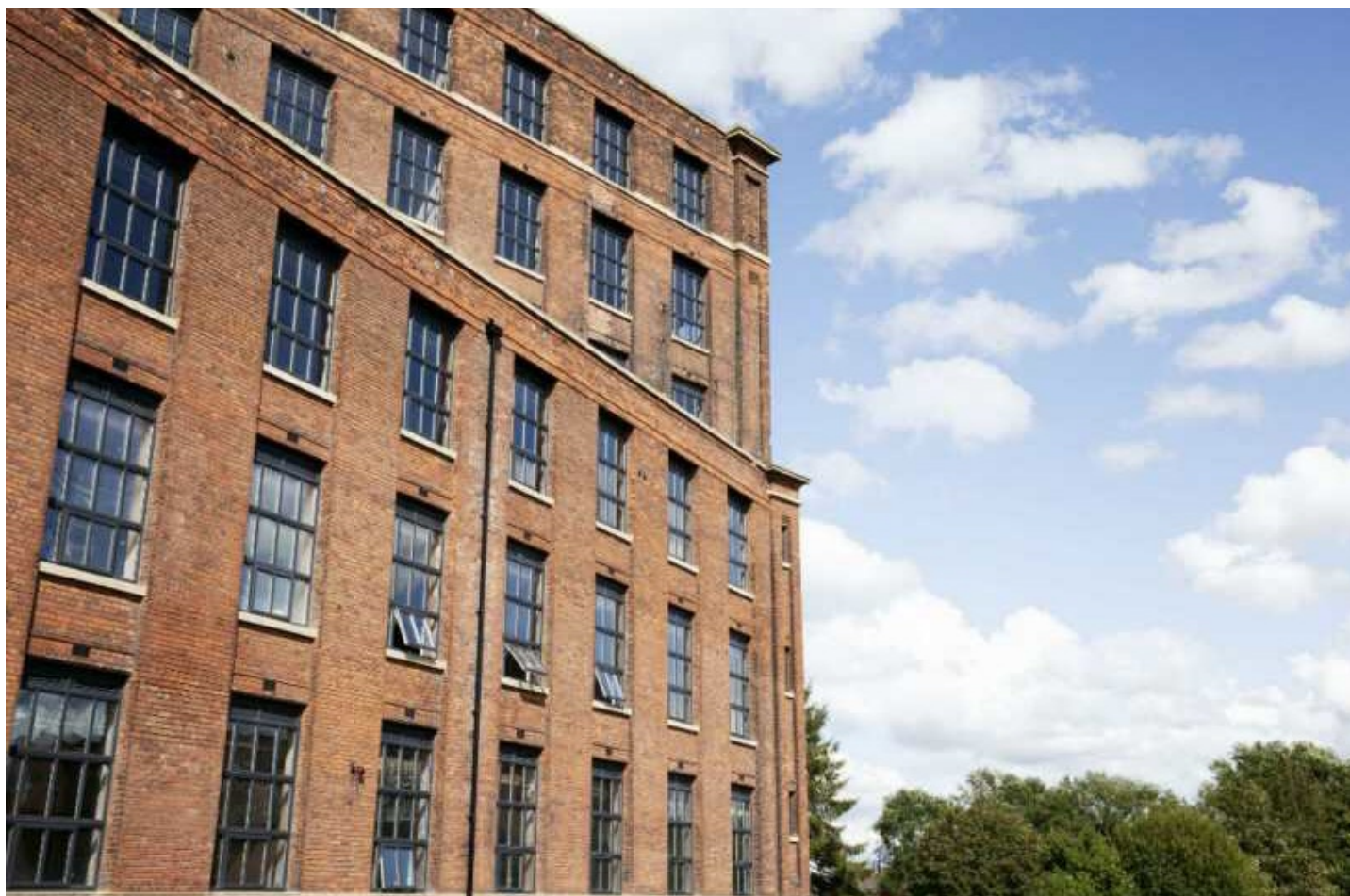
Mather House, Leigh WN7 2PW Price £229,950