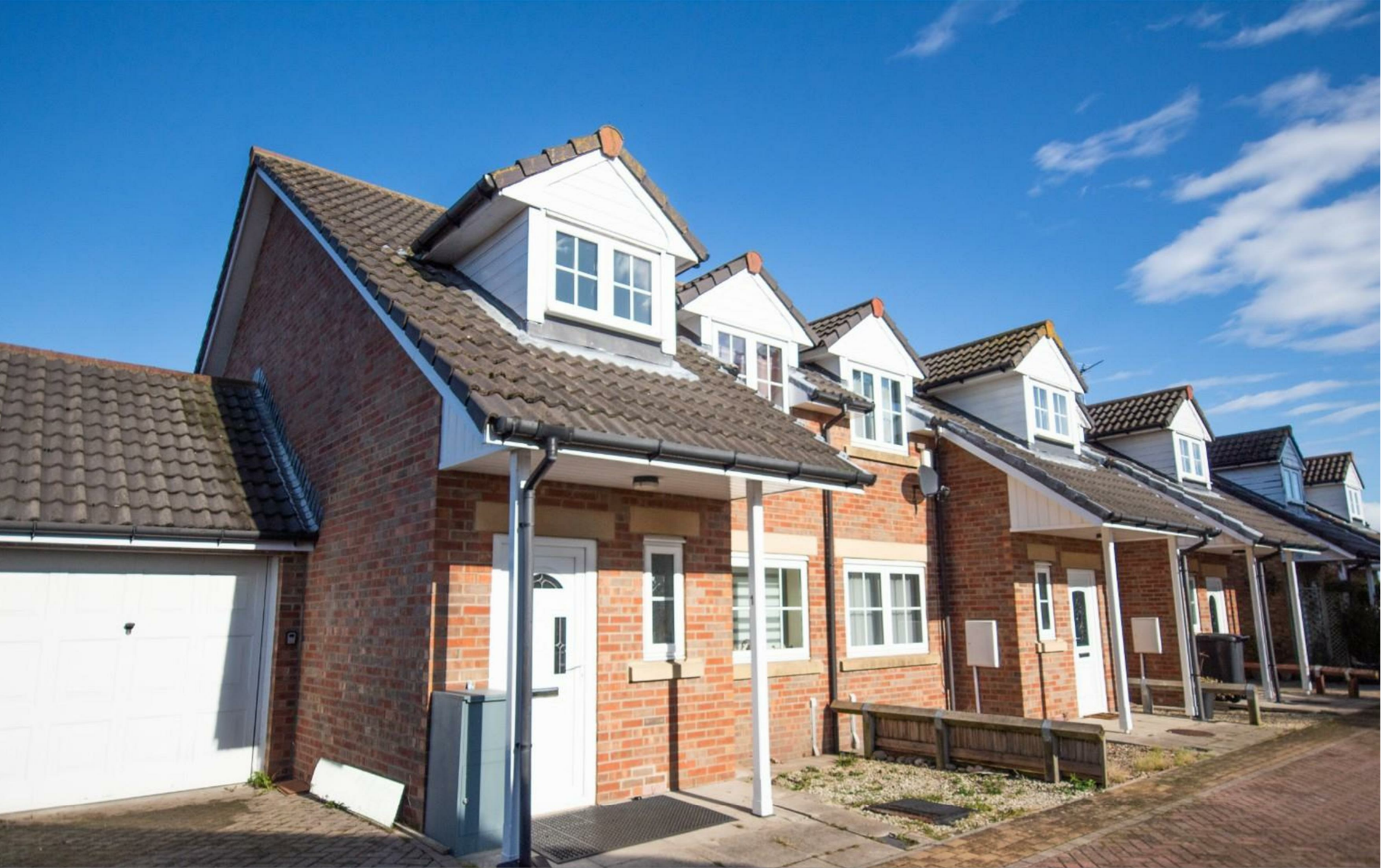
📍 Station Mews, Morpeth NE61 5QX