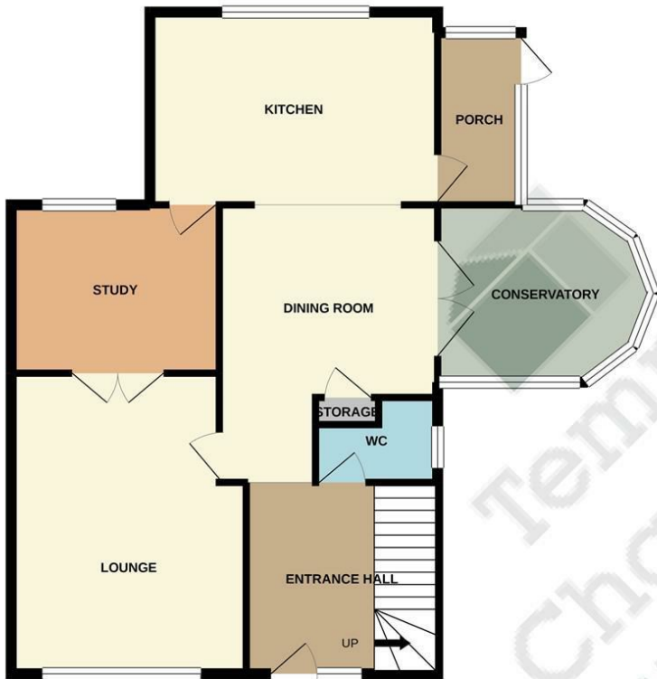
GROUND FLOOR 81.9 sq.m. (882 sq.ft.) approx.