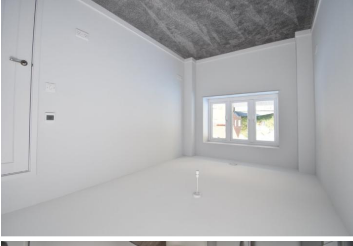
Total area: approx. 73.5 sq. metres (790.7 sq. feet)

Plans are for layout purposes only and are not drawn to scale, with any doors, windows and other internal features merely