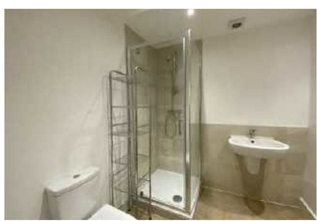
£795 PER CALENDAR MONTH