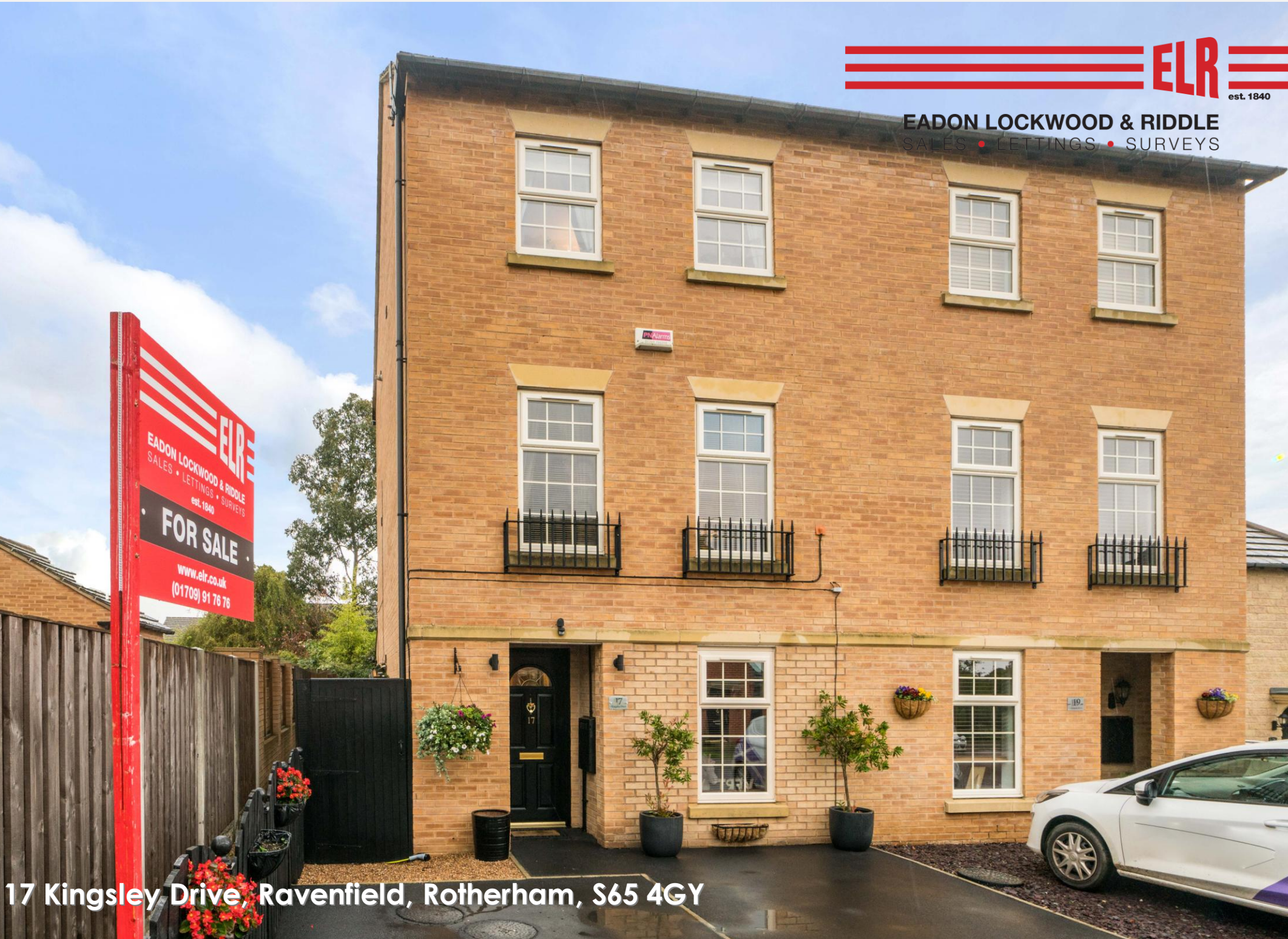
17 Kingsley Drive, Ravenfield, Rotherham, S65 4GY

EADON LOCKWOOD & RIDDLE SALES • LETTINGS • SURVEYS