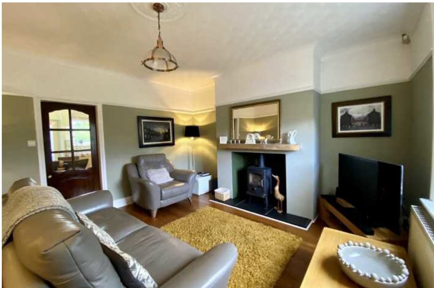
25 Green Lane, Chinley, High Peak, Derbyshire SK23 6ET £219,950