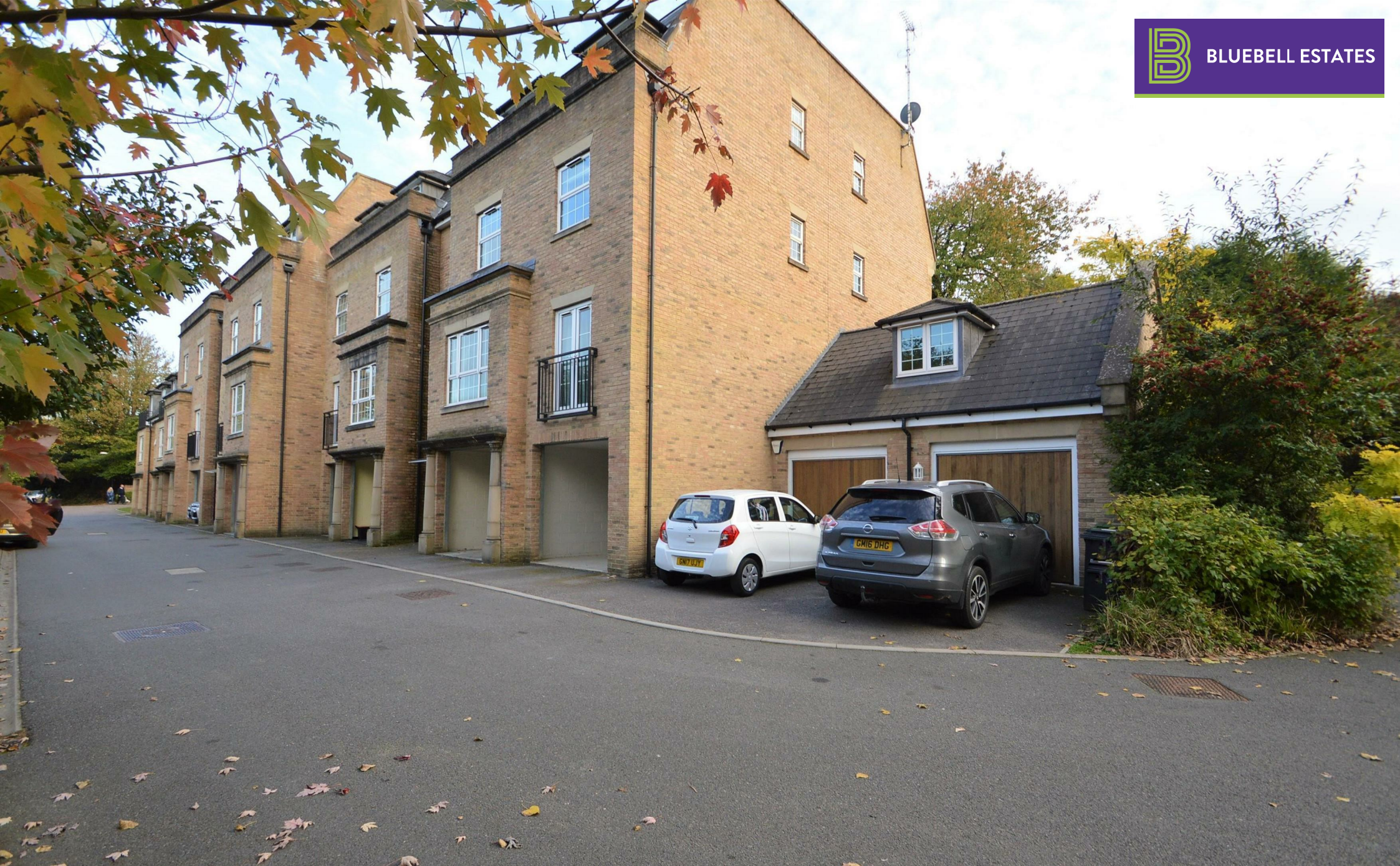
13, The Chimes, Bearsted, Maidstone, ME14 4RE £290,000