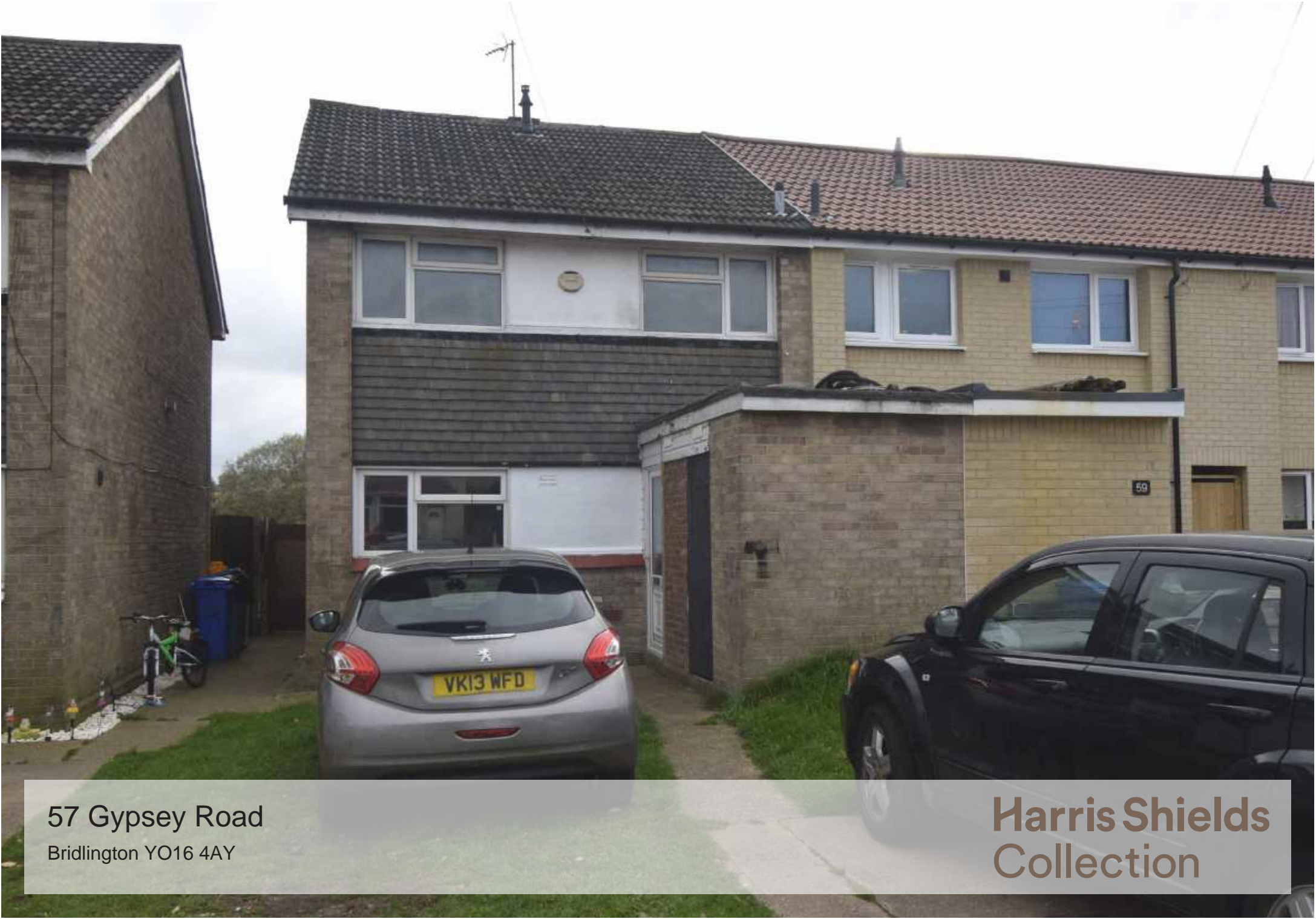
57 Gypsy Road Bridlington YO16 4AY