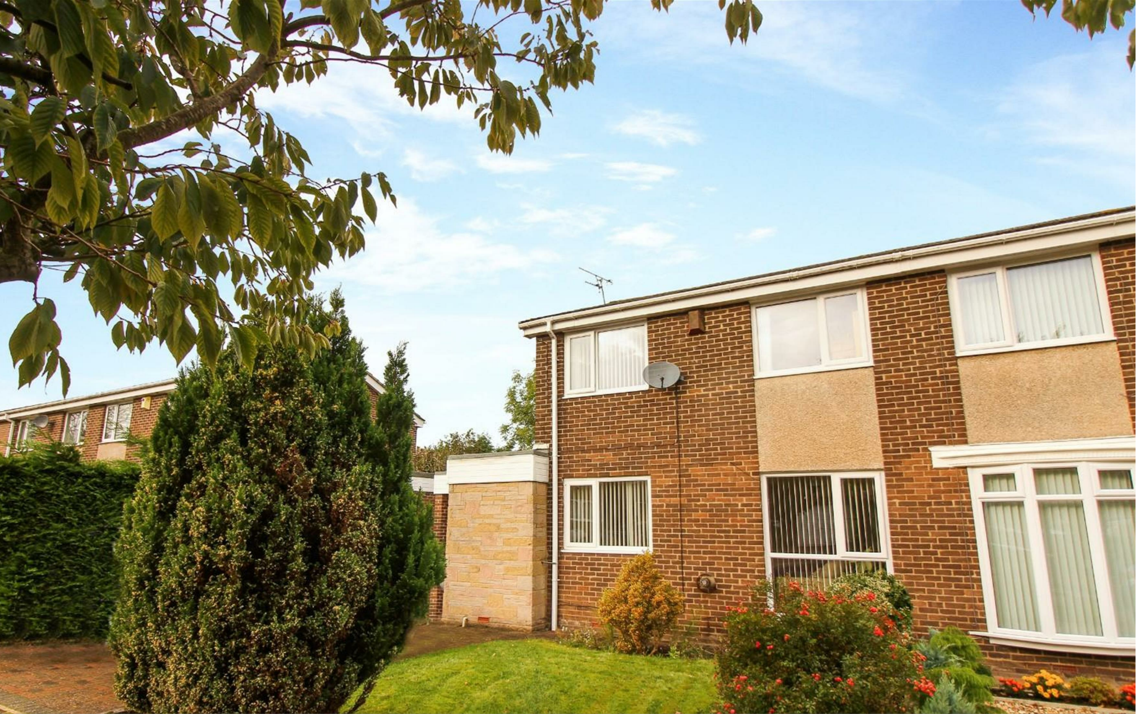
📍 North Leech, Morpeth NE61 3RX