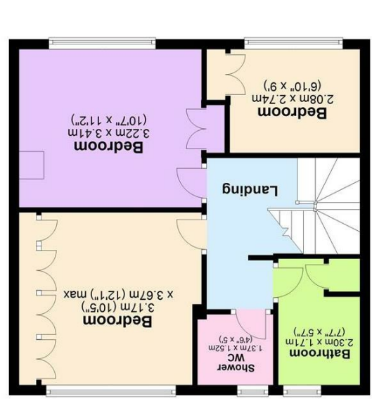
Total area: approx. 114.2 sq. metres (1229.4 sq. feet)