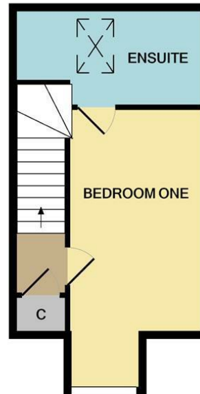
2ND FLOOR APPROX. FLOOR AREA 252 SQ.FT. (23.4 SQ.M.)

TOTAL APPROX. FLOOR AREA 925 SQ.FT. (85.9 SQ.M.)