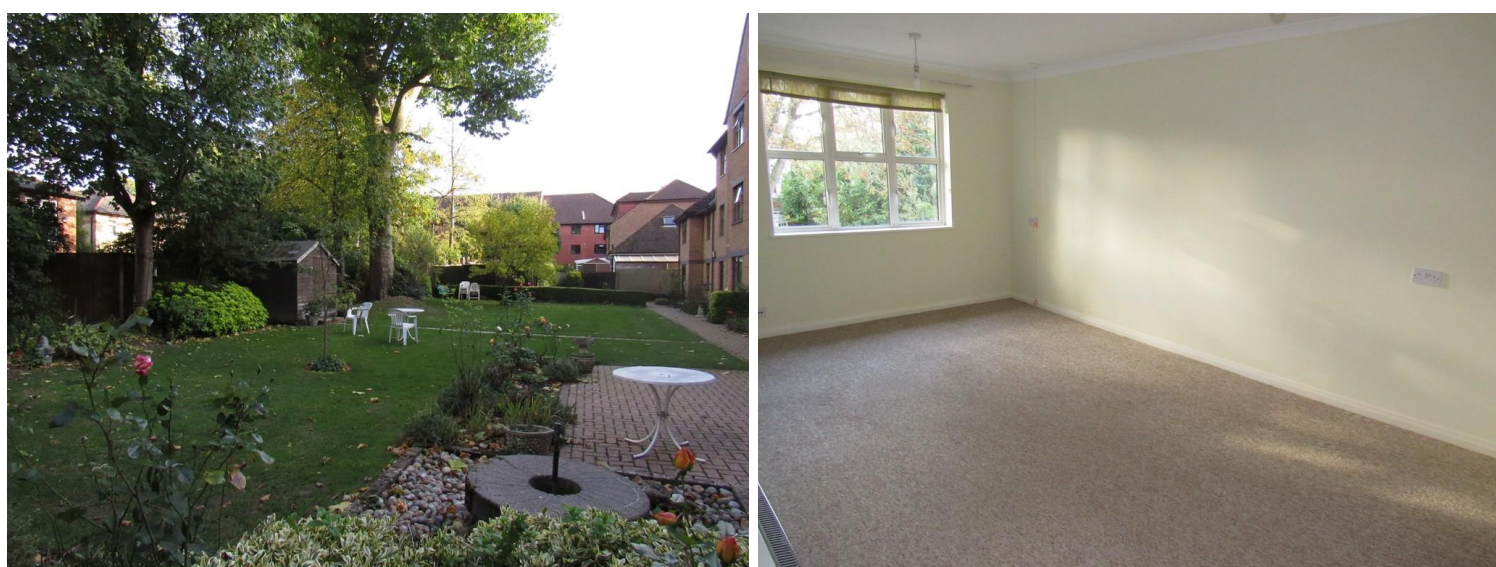
48 Cavendish Court, Holmwood Gardens, Wallington, Surrey, SM6 0HD | £125,000

Paul Graham are pleased to market this 1 bedroom retirement flat. Located within a 'stone's throw' of Wallington high street with its shops and amenities including Shotfiled medical centre. The property is well presented throughout including a modern fitted kitchen and a refitted shower room. Features of Cavendish Court include stunning communal gardens, residents lounge with kitchenette, laundry, guest suite, an on-site Development Manager and Appello out of hours call system.