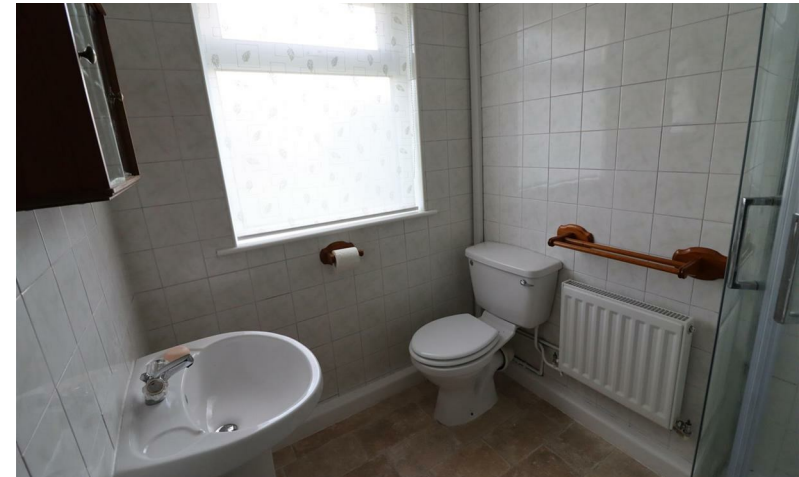
HIGH VIEW CRESCENT, BLACKWATER £795 PCM